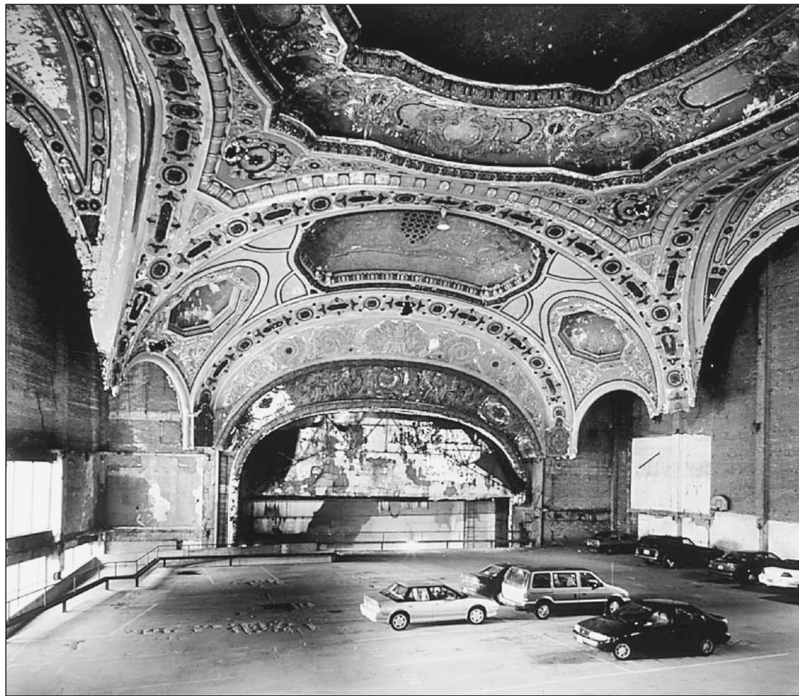
Endless variations that leave his audience numb: Stan Douglas photograph of Michigan Theatre 1997-9

● Until tomorrow at Chelmsford. Box office: 01245 606505. Then between 14-16 March, The Corn Exchange, Newbury. Box office: 01635 522733.