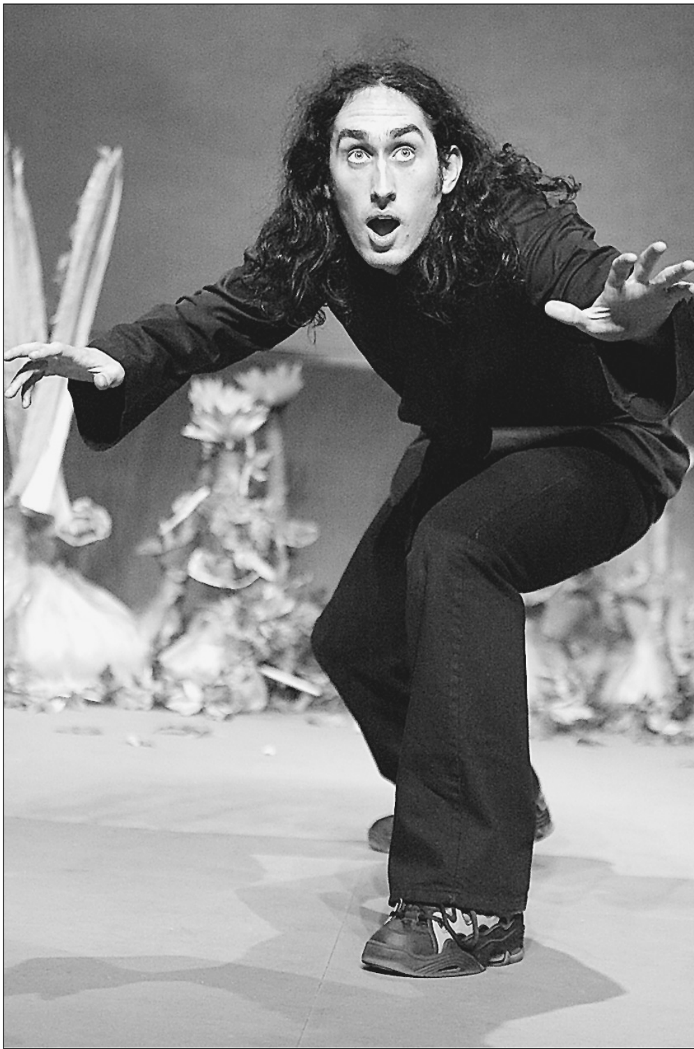
Not afraid of looking silly in a physical show packed with chuckles: Ross Noble at the Garrick Theatre

There is more physicality now than in last autumn's Vaudeville Theatre residency. He is not