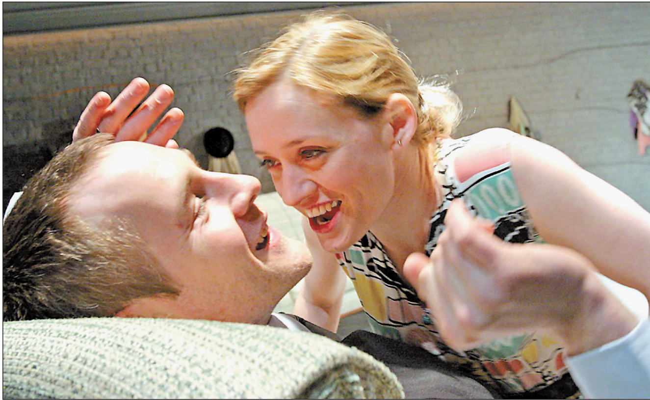
Bruised boozers: talented duo Peter McDonald (Donal) and Anne-Marie Duff (Mona) give forceful and emotionally volatile performances

JP Miller's Days of Wine and Roses , made into a movie with Jack Lemmon and Lee Remick, treads in Eugene O'Neill's footsteps as if it were boldly pioneering. From the early moment when Donal, a bookie obsessed by that champion racer Arkle, takes out a hip-flask and volunteers "a quick nip to warm the cockles of your heart",